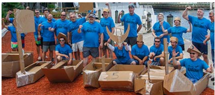
The team-building events' cardboard boats on display.