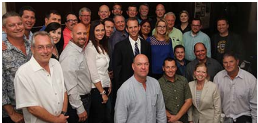
Attendees dinner at Trulucks Seafood, Steak & Crab House.

The power of the Paragon Network is bringing 100% independent FBOs together to increase business through marketing, shared best practices, relationships, constructive feedback, and collaboration on awesome ideas. Based on survey results, we will have a 100% return rate next year and 100% of attendees stated that the meeting either met or exceeded expectations.