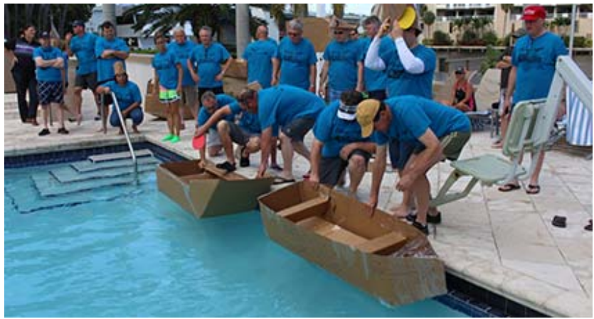
Heat 1 getting ready to race their cardboard boats!

This group of FBOs are the most consistent and dependable operators in North America.