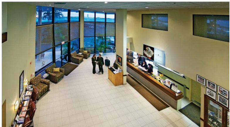
Photo above: The expansive lobby at National Jets (KFLL). AIN Readers ranked National Jets among the top 10% of all FBOs in the Americas.

Paragon Network members were recognized for their outstanding safety, service and facilities in the 2014 AIN FBO Survey of the Americas . Tampa Int'l Jet Center (KTPA) and XJet (KAPA) were two members that placed among the Top 5% of all FBOs rated. Other members recognized include Fargo Jet Center (KFAR) and National Jets (KFLL) , both of whom placed in the Top 10%. Jet Aviation (KPBI) and Texas Jet (KFTW) were also recognized in the Top 20%.